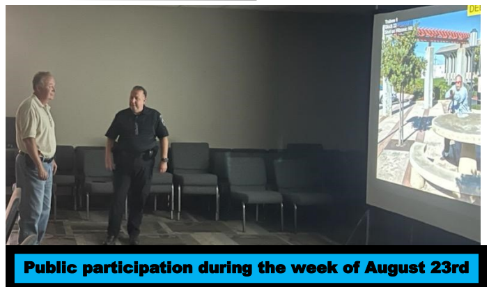
Public participation during the week of August 23rd

As the City's Liability Insurance provider, Midwest Public Risk (MPR) offers a variety of training and education tools, including the use of a MILO trainer. The MILO is a training simulator that uses video interactions for use of force, de-escalation, firearms proficiency and tactical judgement training. TPD offers the public the opportunity to participate in the same training, and MPR allows the City to use the equipment in our facility for a week's time. TPD uses social media outlets to advertise time slots, and are eager to work with the public on this Community outreach initiative. Look for future opportunities to participate.