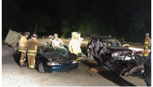
On September 9, 2020, TFD conducted vehicle extrication training and invited several other neighboring Fire departments to participate. This continues a large scale effort to promote partnership County-wide and ensure proper training and professional standards are implemented and followed.

TFD is also participating in Firefighter I and II training for firefighters in Leavenworth County. The department is providing up to 5 instructors at any given time. Individuals completed Firefighter I in the spring and are now completing a modified program, including on line and hands on learning to complete their Firefighter II training. Individuals are tested by the State of Kansas after completion with a current success rate of 95%. This an effort to help facilitate a coordinated cooperative training program within the county to assist individuals who may not be able to attend traditional college classes.